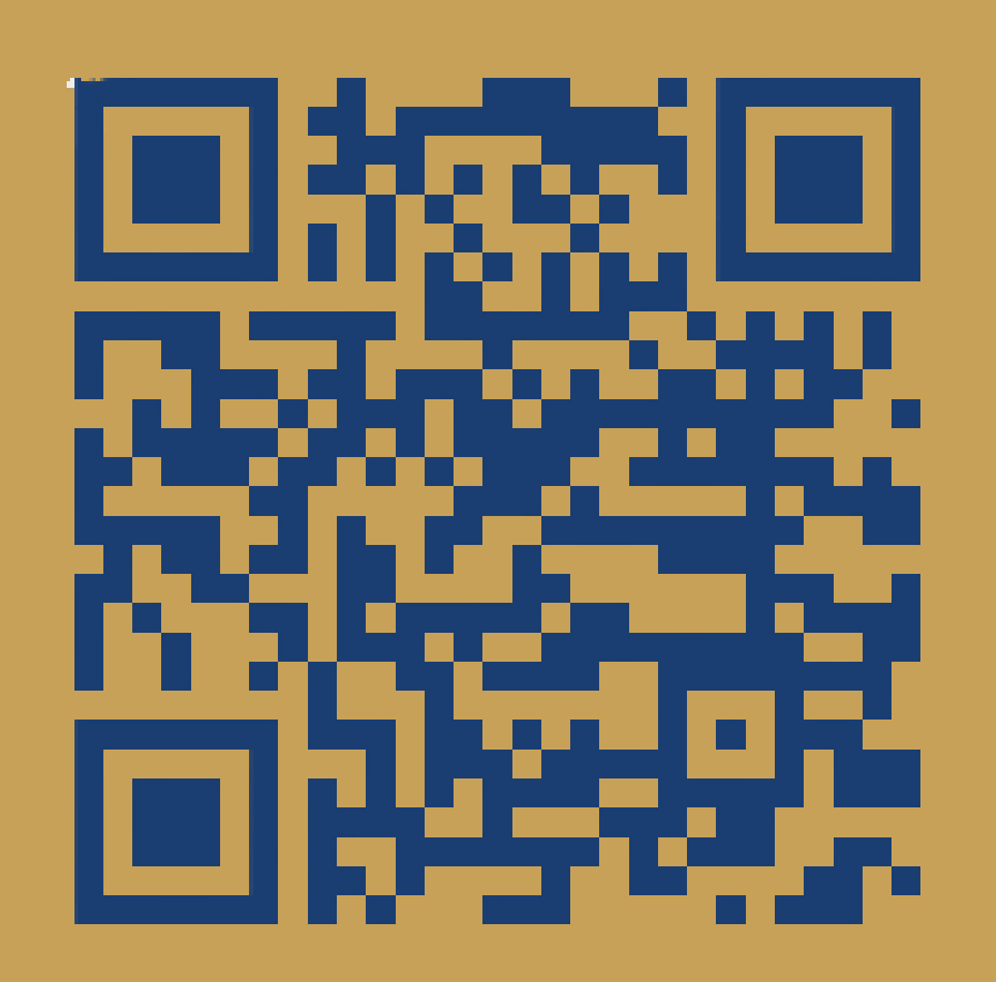
Instagram <a href="mailto:onuscdeclub">onuscdeclub</a>