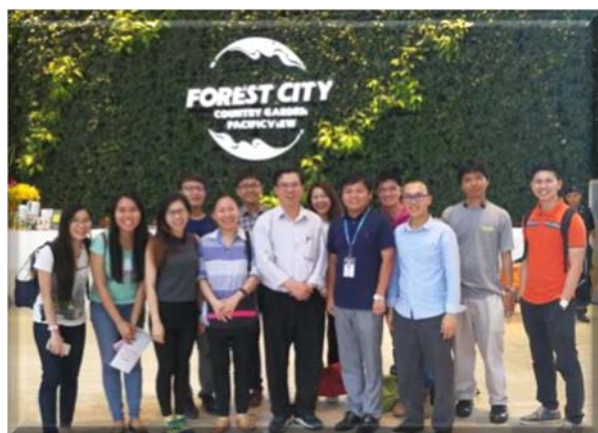
A site visit by 17 students from Master of Science (Civil) MSc class CE5106 “Ground Improvement and Monitoring” Forest City Reclamation Works (at JB next to second link).