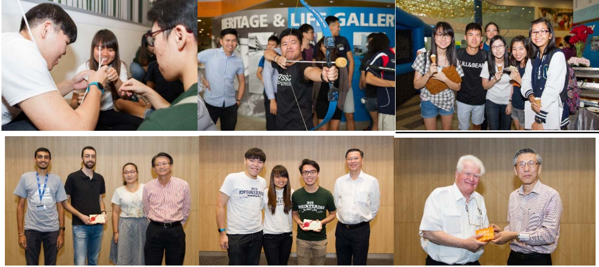
Lots of fun and eating at CEE Day

CEE Day for students and staff organized by the CE and ESESC Students Clubs and supported by HDB and department was held on 25 January 2017 at LT7. A competition in selecting the most interesting engineering solution to climate change and coastal protection also took place during the event.