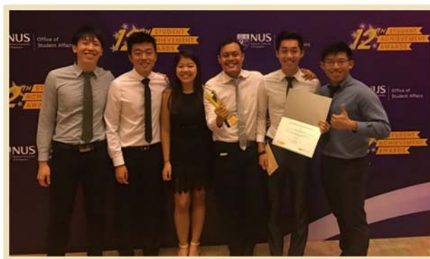
Operation Orion 2015 won Platinum Award at NUS Student Achievement Awards 2017

The highlight of the project was an overseas expedition to Prey Veng province, Cambodia. The trip's focus was on planning and managing the house and water catchment construction in the village. The team also ran some education programmes and had a Christmas celebration at the nearby orphanage.