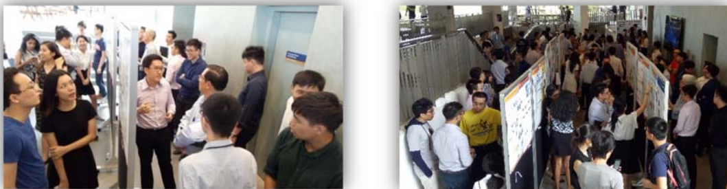
Poster viewing segment outside LT6