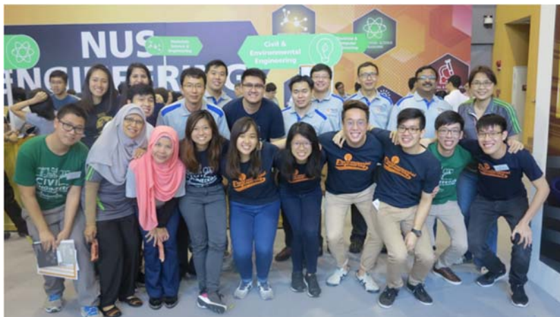
A group photo with our students, professors and support staff at the end of a long day

NUS Open Day 2017 on 11 March 2017 was well received from enthusiastic students and parents. The CEE team demonstrated incredible unity.