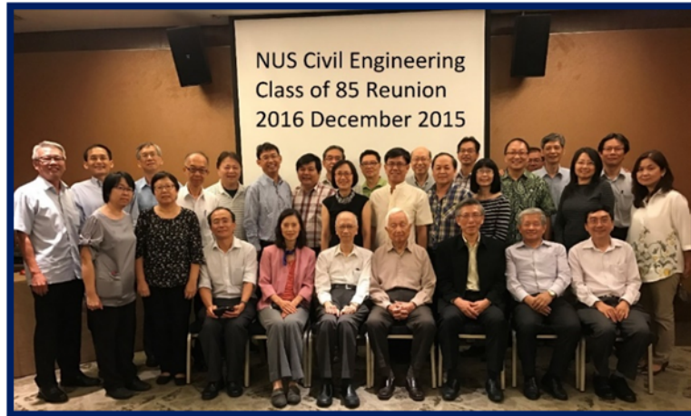
The class of 1985 with their professors at their reunion dinner