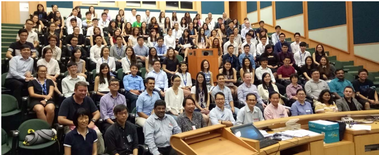
A group photo with all the final year project students, judges, guests and professors

“Students all showed beyond average understanding of subject.”