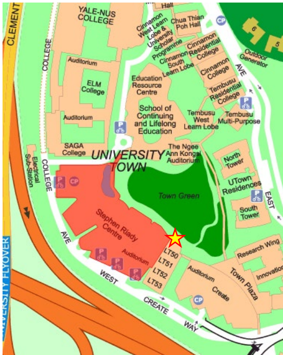
Education Resource Centre – Global Learning Room (Level 2)