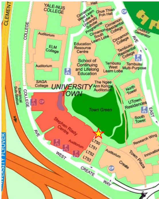
Stephen Riady Centre – Global Learning Room (Level 1)